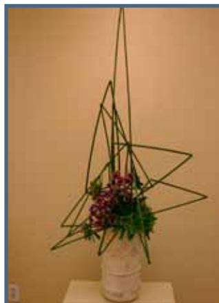
Japanese Ikebana Floral Design Show October 28-30