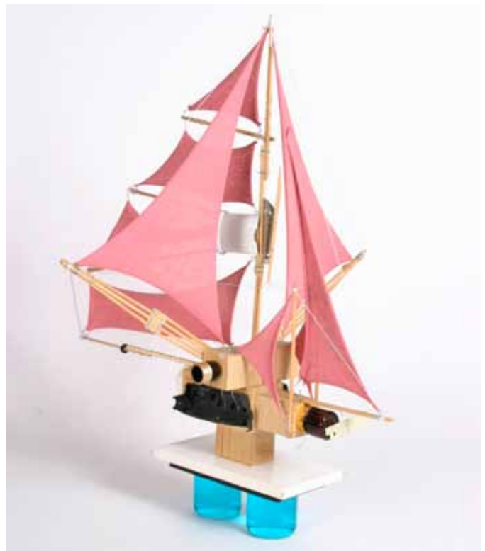
Special Guest Assemblage Artist

This will be a sensual sensation, the vision, the fragrance, the design, music, artists, and friends! Ikebana design shows always make a lasting impression. Find out for yourself when you experience this exhibit!