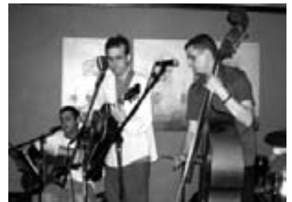
Lazy Preacher plays at AvantGarden.